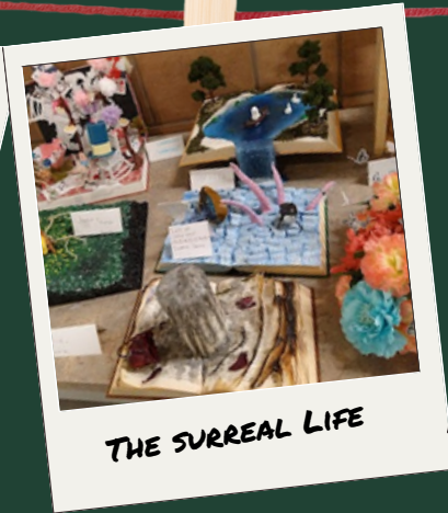
THE SURREAL LIFE